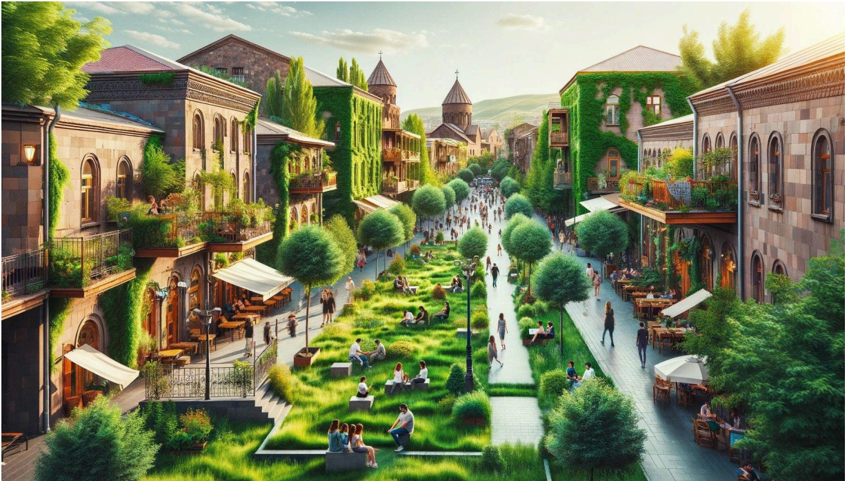
*AI generated "Green Yerevan" vision by Dall-E from Openai